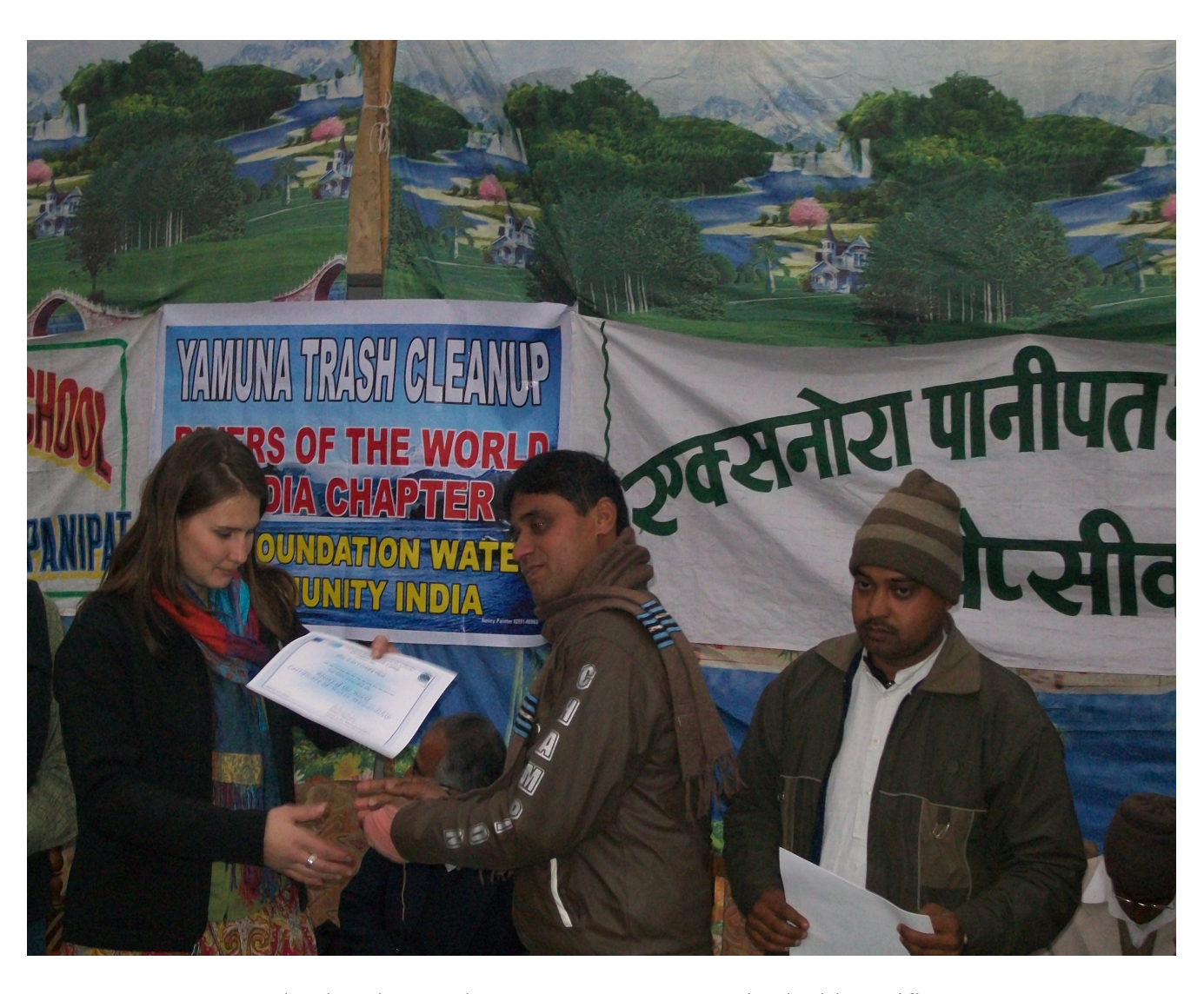
Schoolteachers and guests were next recognized with certificates.