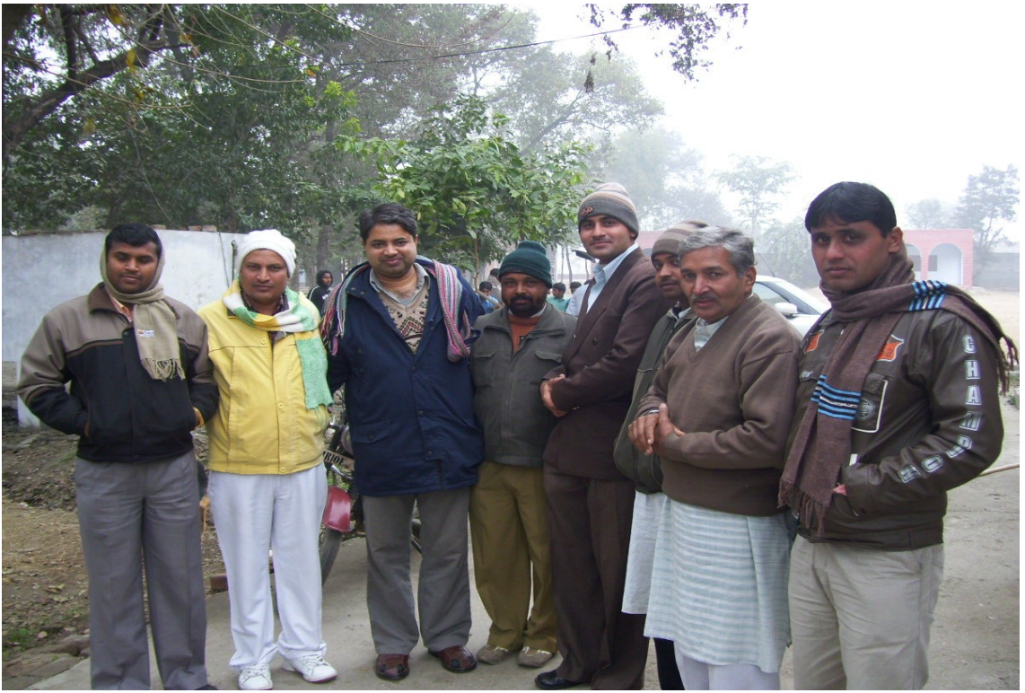
School teachers, and students actively participated at the workshop. The list of students including the "Yamuna Sevaks" and Teachers at the workshop is provided below.