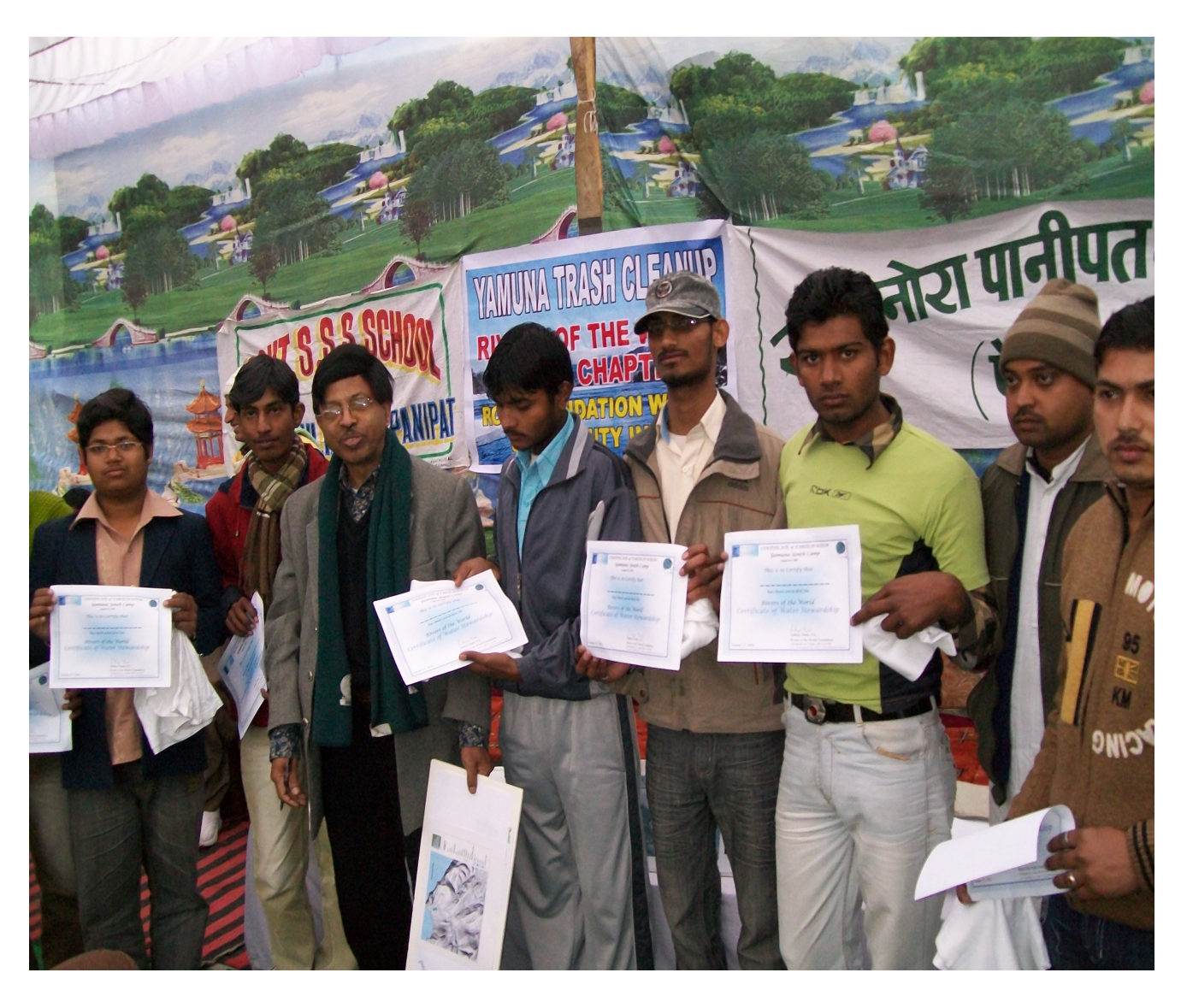
Certificates Presented to "Yamuna Sevaks" (from Aug '09 camp at Samalkha) at this Workshop