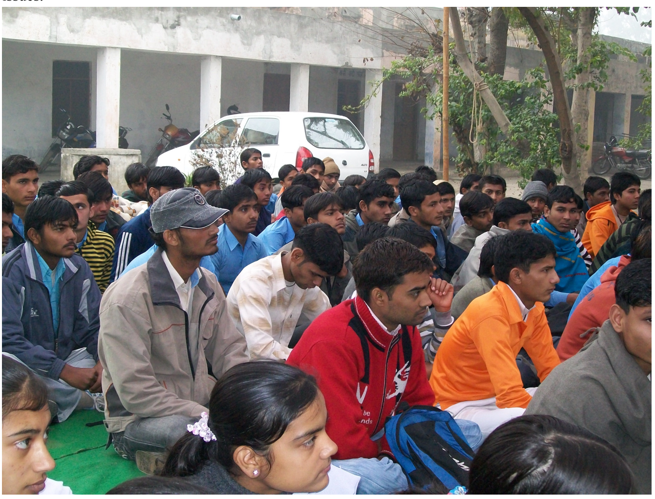
Participants at the Yamuna Workshop in Sanauli.

Siraj Kesar mentioned about the water cycle and how our streams and rivers are facing great challenges these days in keeping their flow and quality protected and what action can be taken up to address these issues.