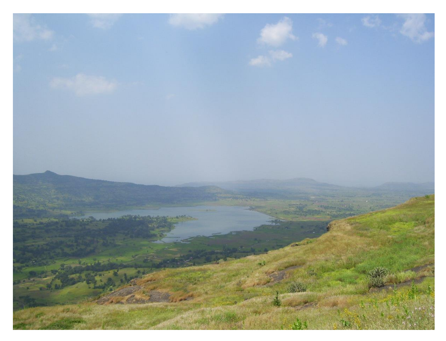
The Godavari River seen from the Brahmagiri peak (above).

While climbing up I noticed how the trail had a few local vendors selling water, fruits, and snacks. This practice resulted in plastics and other trash all around these small shops in the trail. This was shocking. I talked to the vendors and asked them to keep a small garbage bin in front of their shops where people could throw the trash coming out of the products they are selling. They seem to agree and said that they will arrange. That was then.