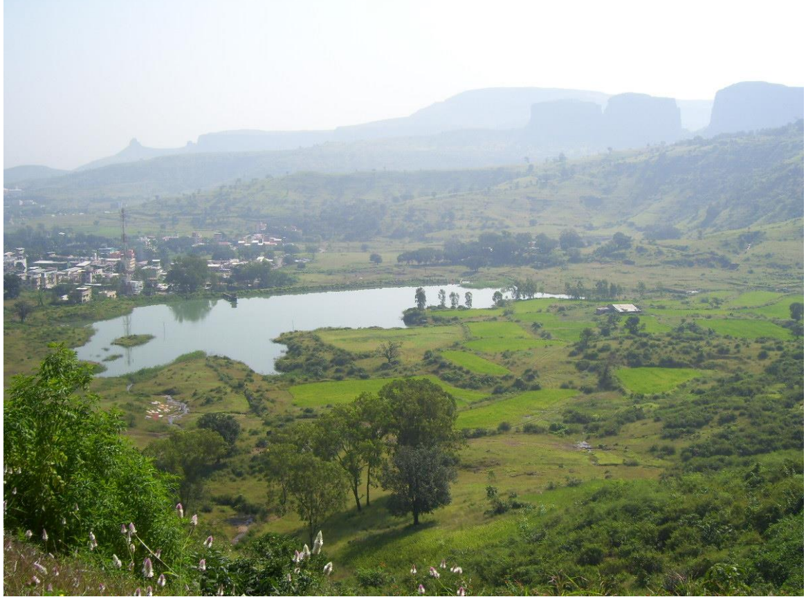
View of Trayambakeswar (above) while climbing to the Brahmagiri

I challenged a vendor and showed her how I could clean the frontage of her shop in 10 minutes, and then asked her if she could do that twice a day.