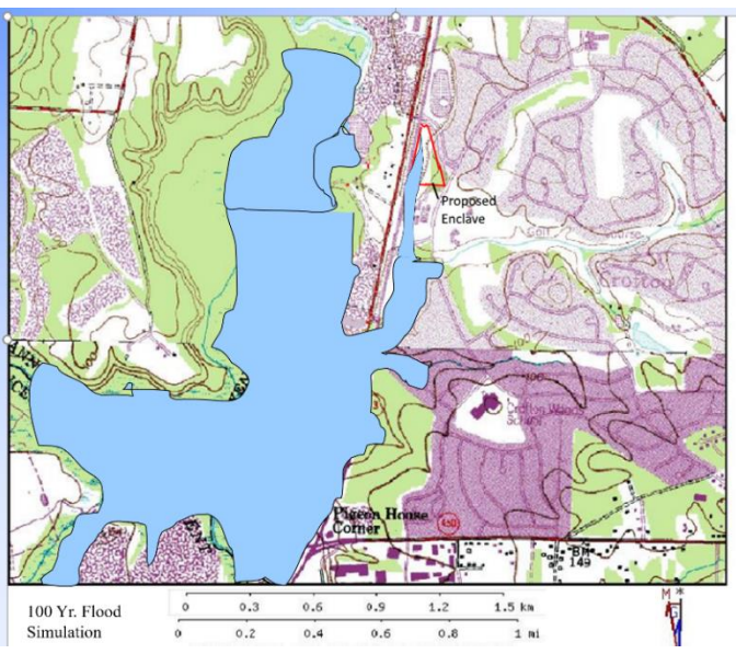
Map 1B – 100-Year Flood Simulation

concurrence, the total parking space will take away roughly 3 acres or ~50% of the land planned for the Enclave development. This additional impervious surface in the existing low-lying and/or tree-covered area will increase the runoff for a 4"- 24hr. rainfall by 0.85 acre-ft or 277,000 gallons just from the parking area of the development. This runoff would have only one way to go. That's downhill to the lowest elevation. This could easily result in a flash flood of the western boundary of the development and overflow into Route 3. Any higher rainfall events (25-yr., 24hr, or a 100-yr. 24-hr. is anticipated to have a much devastating consequences for the local residents and temporary closure of route 3. There is a possibility of even sink-hole development on the east side of North-bound route 3 since the location was a gravel pit in 1950s. Map 1C shows a comparative USGS topo map for the site from 1957 and 2018.