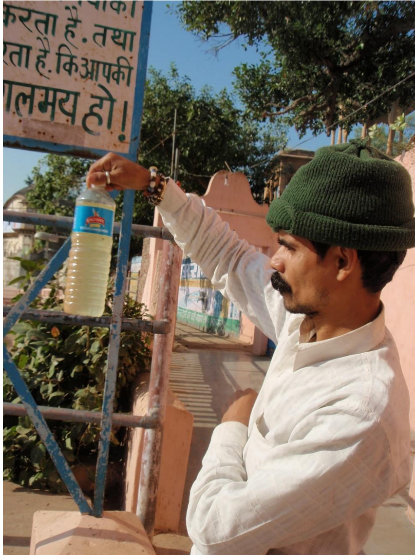
Picture 3 – Water clarity of Mansi Ganga Kund Feb 9, 2010

The turbidity/clarity of the kund water in 2010 is apparent from the picture 3 below. The wastewater from houses around the kund were discharged into the kund as shown in picture 4 below.