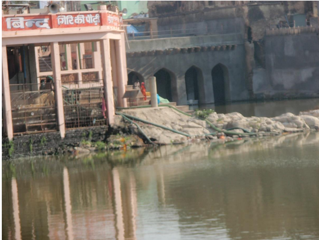
Picture 4 – Household discharges through pipes (2010) Photo: Subijoy Dutta, Feb 9, 2010