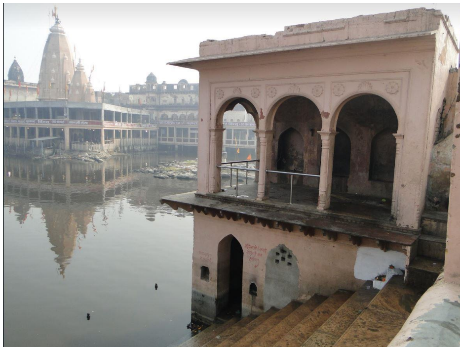
Picture 5 – Discharges through pipes (2018)