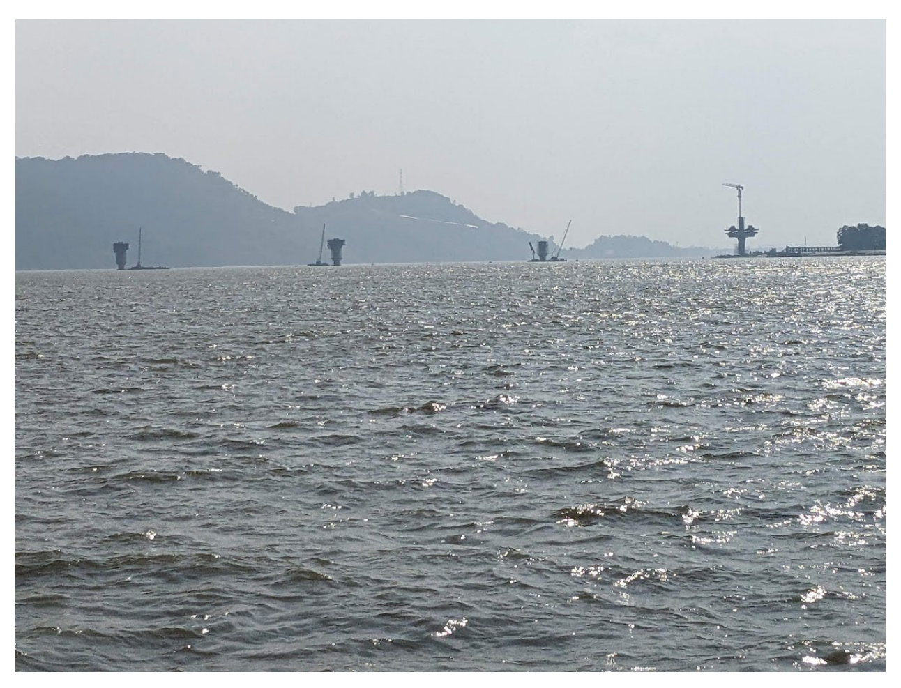
New Bridge across the Brahmaputra River - under construction