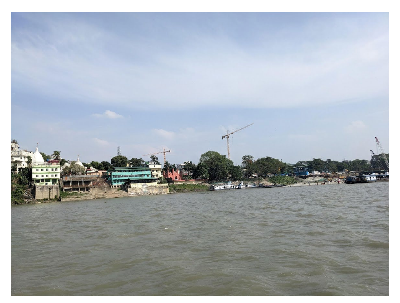
A close-up look at the Bridge Construction area in the Guwahati area

For more pictures see the link <u>https://photos.app.goo.gl/7zajtPtkKnUsiNaN8</u>