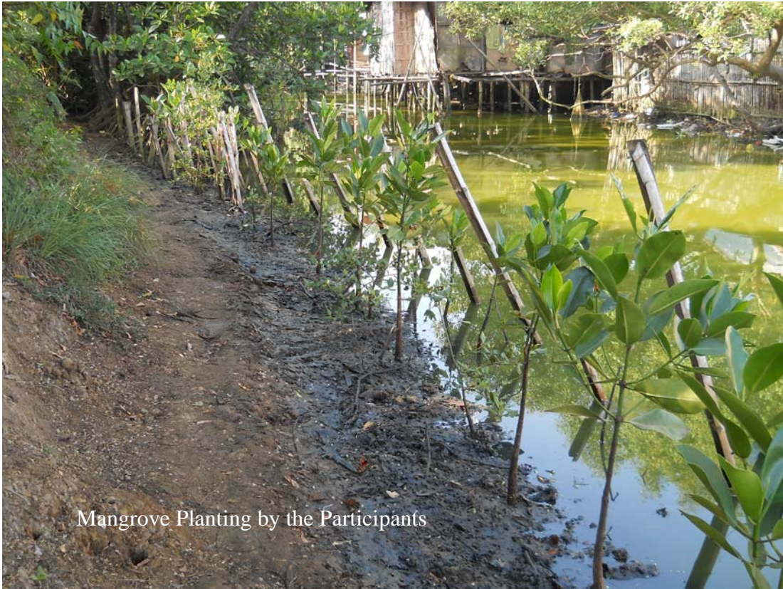
Mangrove Planting by the Participants