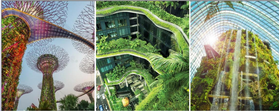
Sustainable Cities The Transformation of Singapore

Please click here to see this full presentation