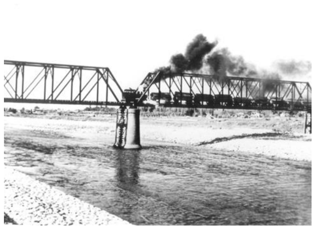
Diesel locomotive pulling railway cars with cedar logs across Nahari River in 1949