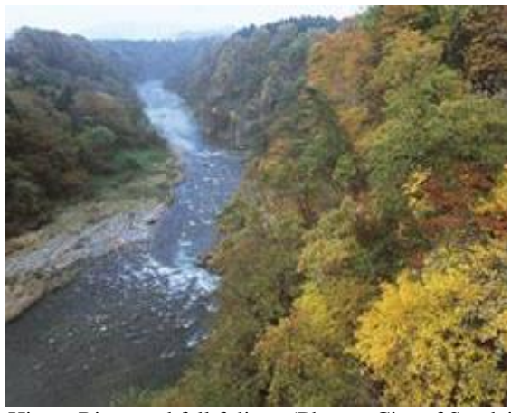
Hirose River and fall foliage