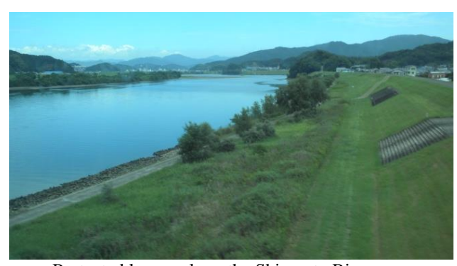
Protected levees along the Shimanto River