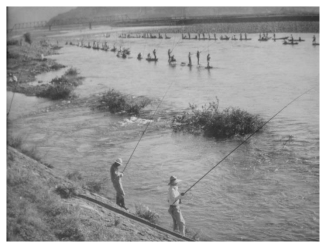
Fly fishermen on Nahari River – 1960

Ayu ( Plecoglossus altivelis ) are called sweetfish due to their sweet taste. It is a preferred fish for eating, especially after skewering them and roasting over a fire of wood or charcoal. Unfortunately, the ayu is an anadromous fish like smelt and must go upriver to breed. The Nahari River has three major dams upriver, which stop the migration of the fish going to breed. The ayu are now less abundant on the Nahari and also in other rivers of Japan. The fishing season for ayu opens in June and even though numbers of ayu are less abundant than historically, fly fisherman still strive to secure preferred fishing spots for the opening day of the season. Historic pictures were obtained by Ms. Masako Sakamoto of her grandfather-in-law fishing.