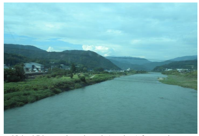
Nahari River - viewed north (up river) from train

Further east in Kochi Prefecture on the island of Shikoku is the Nahari River, which flows through the small town of Nahari. I visited this area in 2011 and again in 2013. The town of Nahari is on the south side of Shikoku Island and the Nahari River empties into Tosa Bay. Back in the mid-1900s, the Nahari River was a major attraction for fishermen hoping to catch ayu with their long fly rods. Most Japanese fly rods are 5-7 meters long, but some reach 10 meters long. The technique used is much different than traditional western fly rods, which are relatively short and require numerous back and forth movements to slowly get enough line out to drop the artificial fly where desired. The Samurai practiced ayu fishing over 430 years ago during the Edo Period when sword fighting was prohibited. The fishing rod replaced the sword and walking on small rocks in the rivers was a good training exercise to maintain leg muscle and balance.