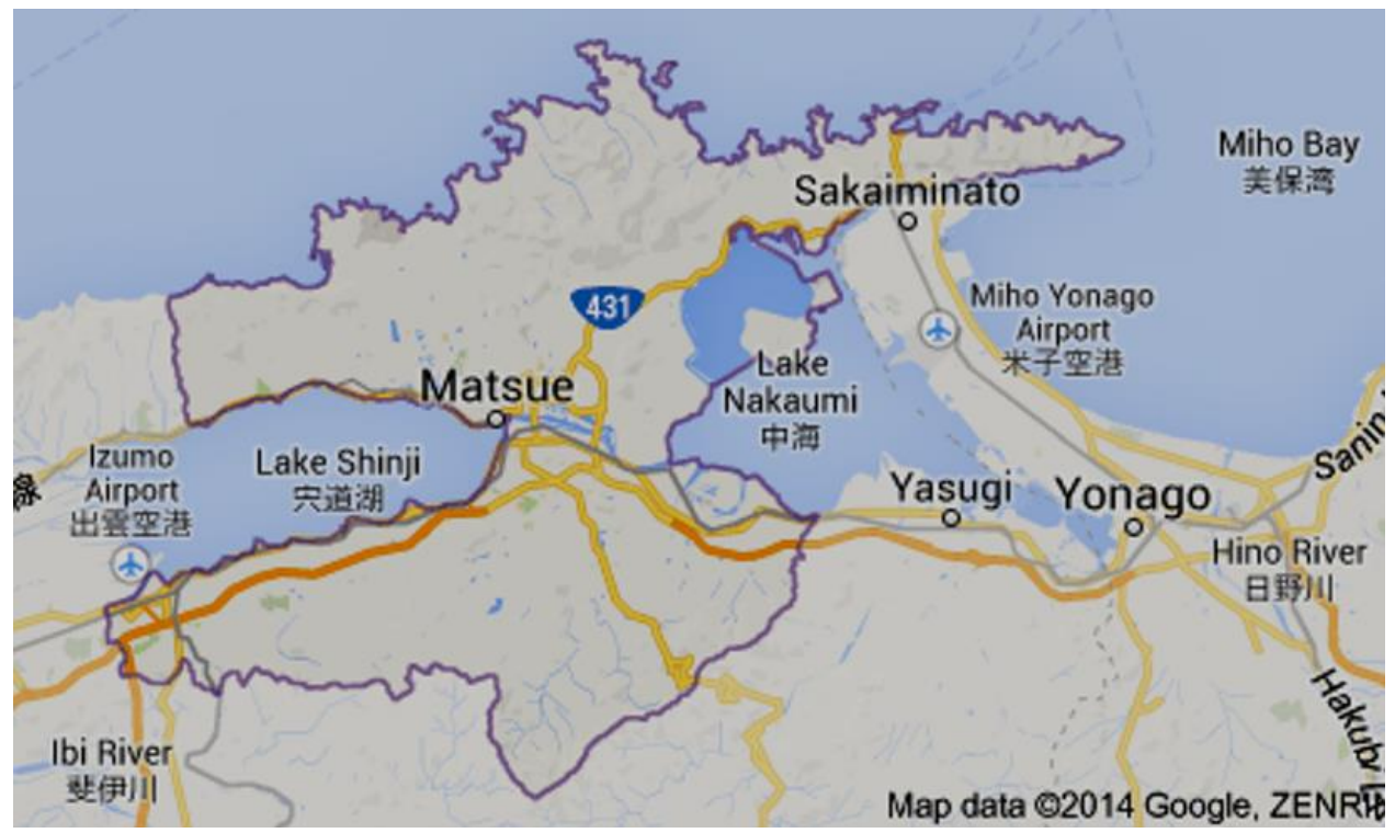
Map of Lake Shinji, Lake Nakaumi, Miho Bay, and Sea of Japan

Fortunately, both the countries of Japan and the United States realize the values of their rivers and are working hard to protect these unique areas. Although Japanese have great respect for their rivers, the dense human population in Japan requires dams on the rivers for municipal water and also for hydropower. One of the organizations in the United States that has interests in all rivers of the world is appropriately named Rivers of the World Foundation and has professional volunteers working in many countries to improve and protect our valuable river resources (http://www.rowfoundation.org/).