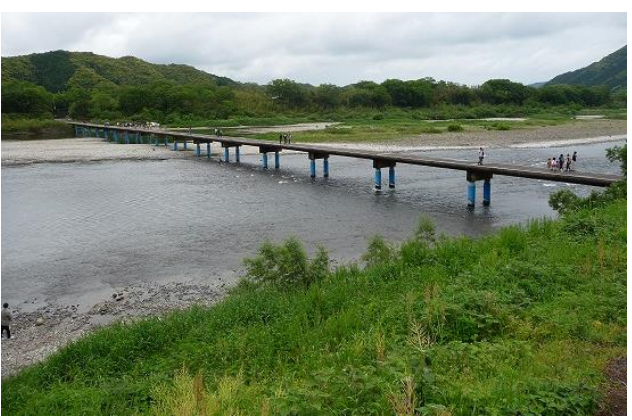
Chinkabashi on Shimanto River