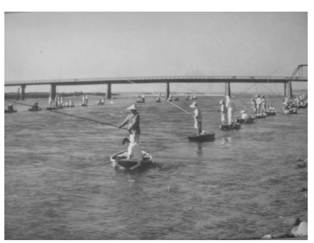
Fly fishermen on Nahari River – 1960