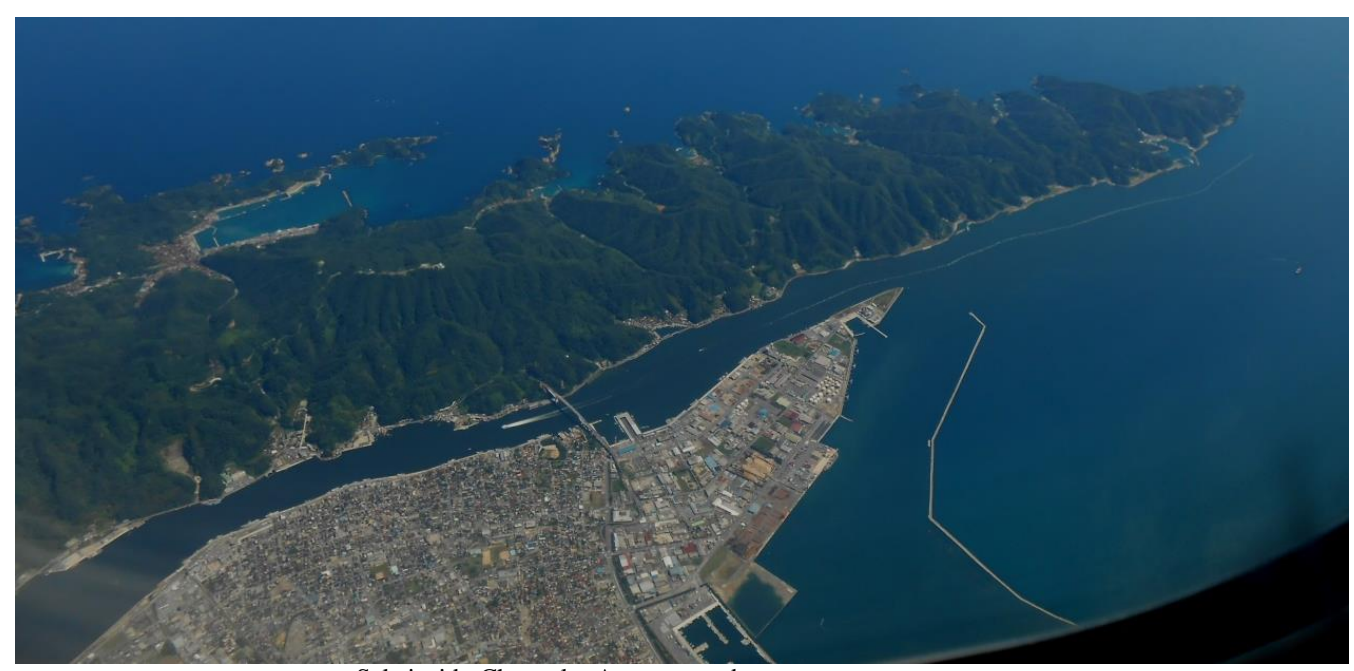
Sakaisuido Channel – A waterway between contrasts

The Shimane Prefecture in Japan is famous for being the home of myths. One of the most famous myth of Shimane is about how the Matsue area that I photographed was originally formed. The legend passed down for centuries was that one of the Japanese gods thought this area of Japan was too narrow and cramped. So he used ropes to pull land from other areas of Japan and form what now is the unique and beautiful area I saw from the plane. Geologists might have other explanations, but I like is interesting and mystical legend and it makes the Shimane area truly "the Land of the Myths."