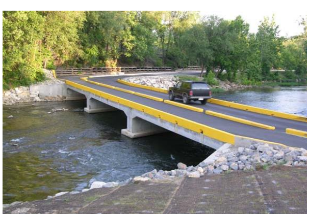
Sinking bridge on Roanoke River, NC, USA