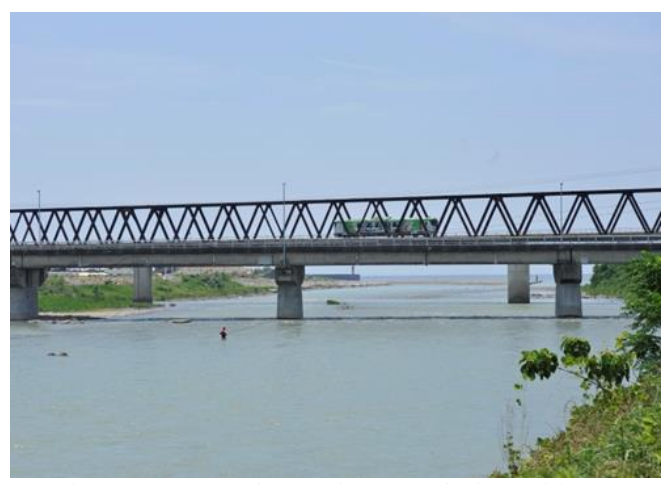
Modern passenger train crossing Nahari River with one fly fisherman in River

Ayu is also the main fish captured on the Nagara River, east of Kyoto on the main island of Honshu. However, fishermen on this river use cormorants that have been trained by the fishermen to catch the ayu. A snare is tied near the base of the bird's throat, which allows the bird only to swallow small fish. When the bird captures and tries to swallow a large fish, the fish is caught in the bird's throat. When the bird returns to the fisherman's raft, the fisherman removes the fish from the bird's throat. This method, called ukai, is not as common today since more efficient methods of catching fish have been developed. I first learned of the use of cormorants to capture fish as a child from the classic tale of Ping, but have never witnessed it.